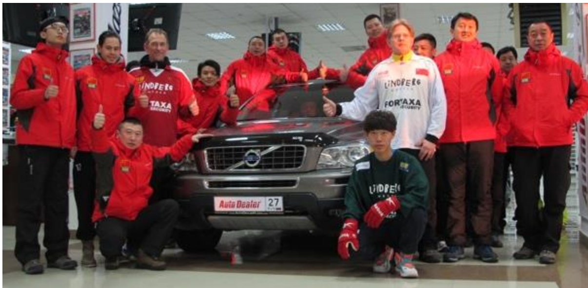
China National Bandy Team at the end of the road from Chengde Bandy Winter Classic to World Championship in Khabarovsk 2015 with support from Volvo

Sandvik, Baikai Energy, Rebook, Sportewa, Lindbergs, TuTwo, Foot Balance, Fortaxa, Kambi, Lannebo Fonder, SCA and Volvo for their support on the tour from Chengde to Khabarovsk...with the hope that Bandy will reach Olympics 2022